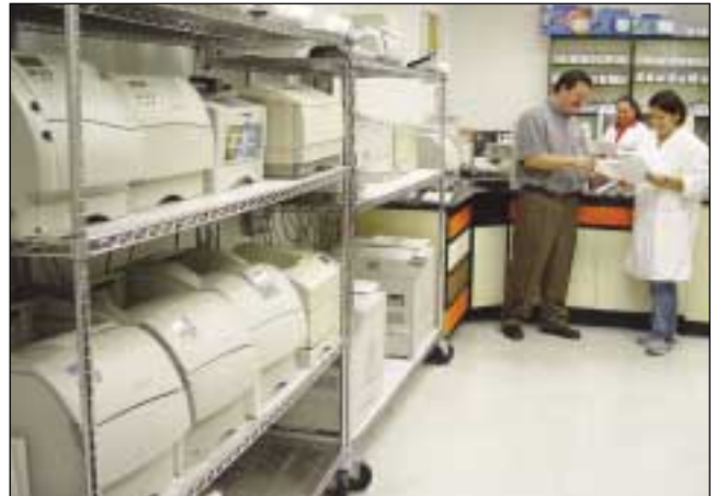
MSE's documented failure rate of less than 0.8 percent is monitored daily in the Quality Control Lab.

Many of the company's clients are manufacturers who partner with MSE in an outsourcing relationship. Outsourcers usually come to MSE in one of two forms. They are manufacturers that either completely close their production and outsource their entire production, or continue to manufacture certain models and complement their product line with MSE products. MSE's outsourcing clients place orders that