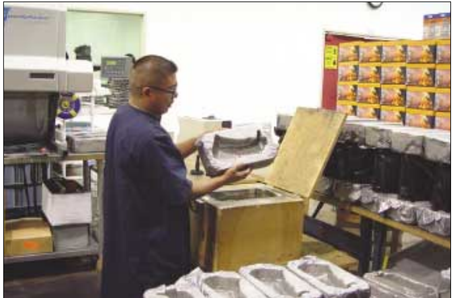
MSE's foam-in-place packaging system is unique, allowing cartridges to remain more stable during shipping. The foam, as well as the boxes, can also be used by customers who are interested in recycling.