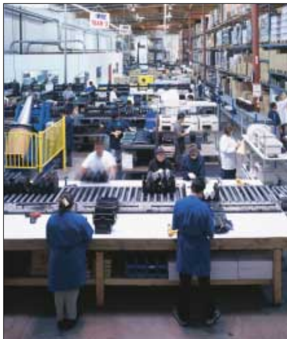
Building No. 1 of MSE's four facilities in Chatsworth, Calif.

Contact MSE at (818) 407-7500 or visit www.mse-usa.com .