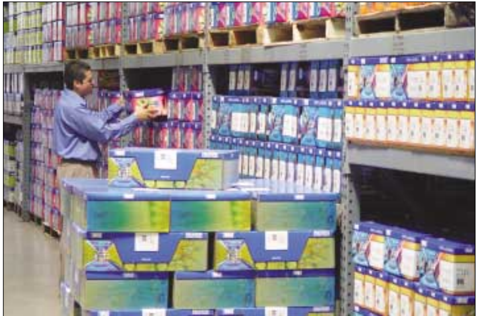
MSE has the ability to ship from its four North American facilities located in California, Pennsylvania, Canada and Mexico.

The company feels the real potential and impact of this technology will be apparent when manufacturers like HP decide to release the same tech-