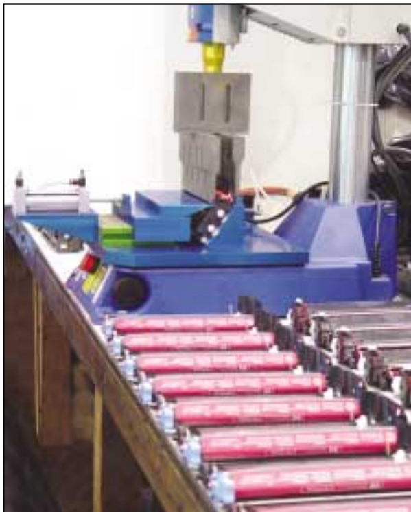
MSE has also expanded its Patented Ultrasonic Welding Technologies to include the HP 4600 compatibles, resulting in precision alignment and matched colors.

MSE will also evaluate the standard cartridge manufacturing processes and see