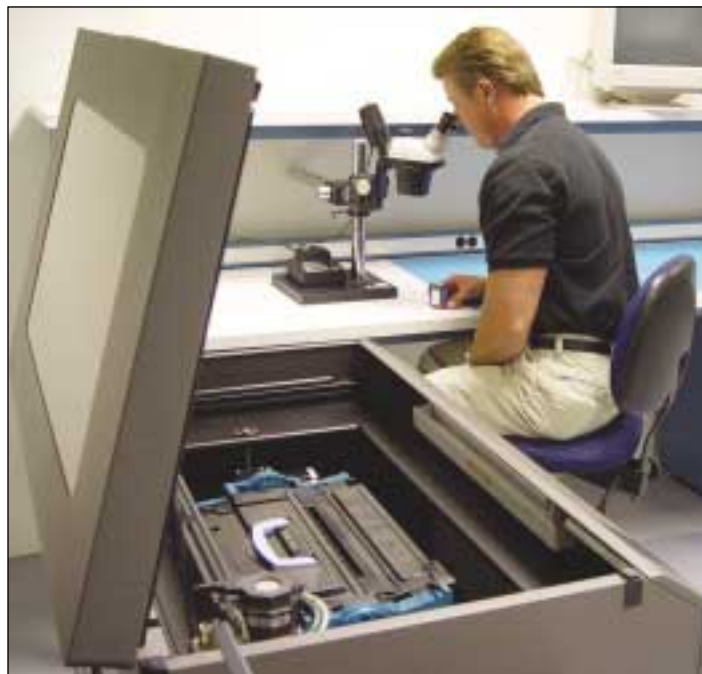
At the Research and Technology Center, MSE engineers are expanding uses for the company’s Patented Laser Cutting Technologies.